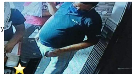
Caught on Camera, Gangster Vikas Dubey 'Spotted' at Faridabad Hotel, Gives Cops the